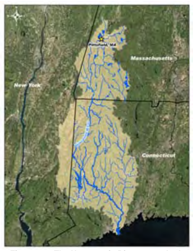
Figure 3-1: The Housatonic River watershed.

The Housatonic River has eight major tributaries that are located partially or entirely within Connecticut. They are as follows: